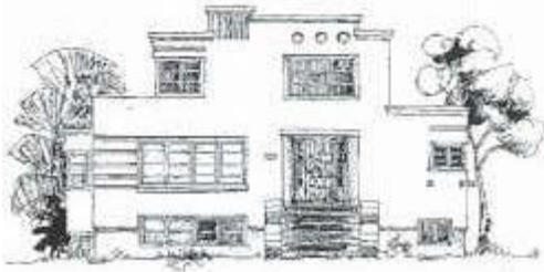
Wardill Residence, 755 Terminal Avenue N. (Streamline Moderne)

While segregation within the British community was defined by class structure, Nanaimo was also clearly divided by race. The Snunéymuxw were gradually pushed to the south end of Nanaimo to make way for the building of wharves. On their designated reserves they had their own churches, stores and schools. Erected by the government or by mission societies, these buildings reflect British rather than native Snunéymuxw architecture.