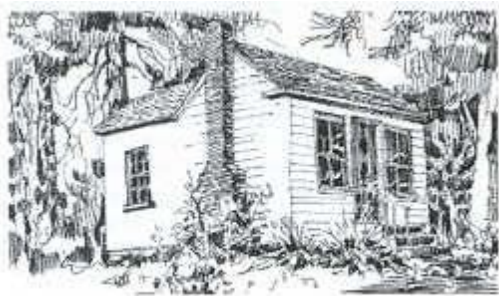
Rowbottom Residence, 100 Cameron Road - (Miner's Cottage)

The new company, under the management of Charles Nicol, very quickly instituted more order to the physical layout of the town. In 1864, the company hired an architect in Britain to draft a town plan based on topographical maps of the area which gave Nanaimo one of its most distinctive features, the fan shaped pattern of the downtown streets. Rather than section the town into a grid of regular rectangles, the streets follow the natural downward slope and bowl formation of the land. Such responsive planning was popular in the 19th and early 20th centuries in the construction of new towns. The radial plan also reflects aesthetic ideals popular in civic architecture at the time. City planning in London, Paris, and in newer American cities emphasized both beauty and reason. Wide avenues and streets were constructed to provide the most attractive sight lines and efficiently move traffic to important districts. In the case of Nanaimo, the radial plan leads the traveller to the primary business district and towards the natural beauty of the harbour.