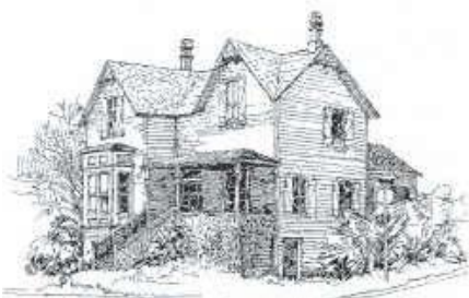
Young Residence, 102 Fry (Late Victorian)

Three distinct architectural styles were popular and well recorded in Nanaimo’s heritage buildings. Late 19th century designs are noted for the Victoria style-evident in such homes as the Rowley Residence (426 Machleary Street), Wood Residence (133 Milton Street) and Harris Residence (375 Franklyn Street). The Victorian style home is often a one or 2 story house with complex rooflines, asymmetrical facades and bay windows. Decorative elements included fish scale or shingle siding (a substitute for the patterning of brick which would have been used in Britain) and scroll cut fingerboard on corners, eaves and porches.