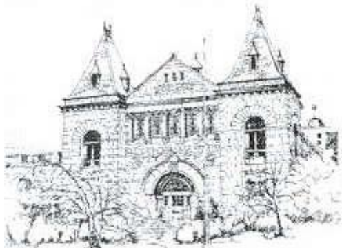
Nanaimo Courthouse, 31-35 Front Street (Richardsonian Romanesque)

Nanaimo inspired a construction boom. The earliest buildings along Commercial, Bastion and Wharf Streets were modest timber buildings. As the town grew, the wooden buildings became more elaborate with attractive windows, decorative finishes and high false fronts as we see on Johnson's Hardware (39-45 Victoria Crescent) and at 33-35 Victoria Crescent. During these prosperous decades, brick buildings like the Earl Block (2-4 Church Street), the Rogers Block (83-87 Commercial Street) and the Hirst Block (93-99 Commercial Street) replaced their wooden predecessors. Providing a sense of wealth and stability, these brick structures also emphasize a proud consideration of architectural detail in elaborate cornices, bay windows and symmetrical designs.