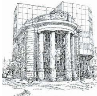
Great National Land Building, 5-17 Church Street (Classical Revival)

The strength and stability of Nanaimo are also felt in the design of Fire Hall #2 (34 Nicol Street), the Courthouse (31-35 Front Street) and the Bank of Commerce, now the Great National Land Building (5-17 Church Street). All three buildings are designed with a monumental sense of authority typical of British architecture. The brick firehall adopts the crenellated features of a castle or battlement. The large rusticated arches and stone construction of the courthouse give it visual weight and solidity. The colossal temple porch of the Bank emphasizes the power and might of the classical past.