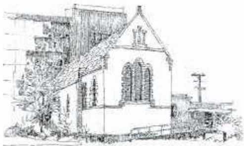
St. Paul's Anglican Church, 100 Chapel Street

Nanaimo's growth is also recorded in its architecture. The first permanent structure to be built in the town was the Bastion (98 Front Street). Its design is consistent with the initial fortifications constructed at the HBC trading posts throughout Canada. Built of hand hewn logs in 1852 by two French Canadian axemen, it has served as a jail, a store, a clubhouse, a museum, and most recently, an interpretative centre.