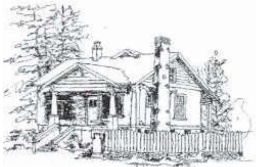
Beck Residence, 610 Selby Street (Craftsman)

Philosophically, the Craftsman style is based on the British Arts and Crafts movement of the 1860s. Founded by William Morris (1834-96), the Arts and Crafts style was noted for its rejection of the pretentious and often overdone decoration of 19th century classical and revival styles, Morris and his followers wanted to achieve a hand-crafted style that honestly reflected local culture and materials. Thus, Arts and Crafts architecture looked back to the simplicity of medieval building techniques and designs. Based on the medieval English cottage, house designs were rambling, asymmetrical formations that proudly displayed supporting timbers, brick work and thatched roofing.