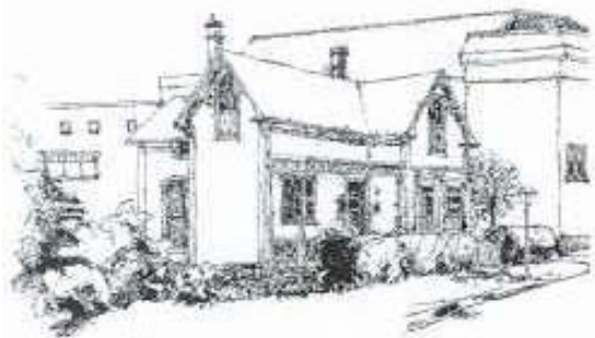
Harris Residence, 375 Franklyn Street (Late Victorian)

For housing style, builders and owners looked to Britain, eastern Canada and, in the early 20 th century, to the United States. Building designs, specially for middle-class homes, were rarely produced by individual architects. Rather, the owners and builders found guidance in plan books, catalogues and building journals. One journal, The Builder , published in England as early as 1842, provided the most current British designs and floor plans. Canadians published their own interpretations of the current styles in The Canadian Architect and Builder , which began printing in Toronto in 1888. For lower-income homeowners and the “do-it-yourselfer”, whole house kits could be ordered from the Eaton’s catalogue or direct from companies such as British Columbia Mills Timber and Trading Company. The packages claimed to include all materials, from finishes to much needed instructions.