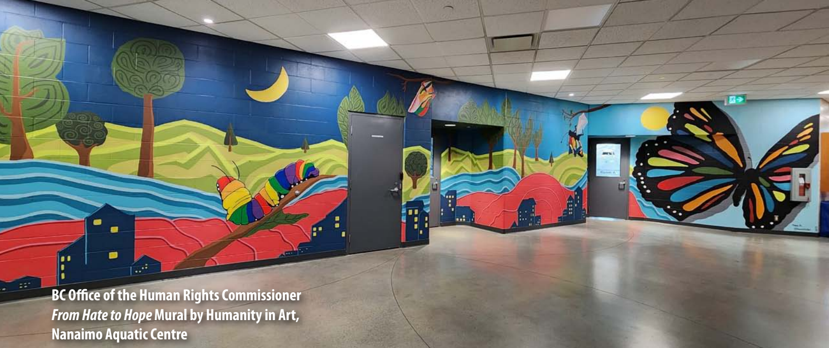
BC Office of the Human Rights Commissioner From Hate to Hope Mural by Humanity in Art, Nanaimo Aquatic Centre