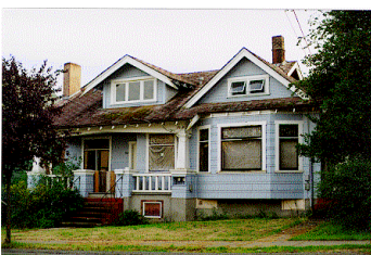
Name: Jones Residence Location: 639-41 Prideaux Street Date: 1907

The residence's height, mass and its location on a high rocky outcropping make it a highly visible landmark.