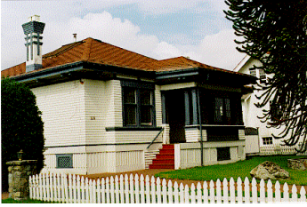
Name: Schetky Residence Location: 225 Vancouver Avenue Date: 1898

Built around 1898 for G.L. Schetky, an insurance agent and U.S. Consul, the Schetky Residence is an excellent example of a transitional Late Victoria/Edwardian style bungalow. The square-plan house has a central front entry with square chamfered columns, and a bellcast pyramidal roof. The long, low proportions mark the change in style at the end of the Victorian era, when tall, asymmetrical houses with highly decorated surfaces and complex roof lines went out of fashion. The ornamentation is limited to scroll-cut eave brackets, banded and corbelled chimneys, and a rear window flashed with coloured glass.