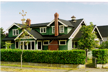
Name: Jenkins Residence Location: 674 Wentworth Street Date: 1924

Aldred House is one of the earliest known buildings in this neighbourhood, just north of the downtown core. Additionally, it is one of few surviving Victorian era buildings of this size and style in Nanaimo. The house is located within a larger grouper of significant heritage buildings and is prominent to the street.