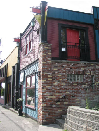
Name: Gulliford Residence Location: 285 Wall Street Date: 1937

Built around 1910, the Willard Service Station Building is a very good example of the type of small scale, vernacular commercial building that predominated in Nanaimo until World War II. A unique element of the building is the multiple storefronts, two of which include false front storefronts. Although the building has been altered over the years, its essential form remains intact and it continues to be used for commercial purposes.