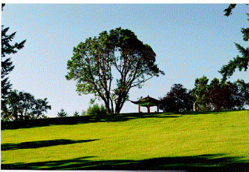
Name: Chinese Cemetery Location: 1598 Townsite Road Date: 1924

The Garden Memorial to Chinese Pioneers is a very good example of an ethnic cultural landscape. The brightly painted, stylized Pagoda structure, inscribed standing stone found on the site, stylized altar for burning joss sticks and other materials, concrete patio with Chinese-style perimeter fencing and graceful arched staircase all give the park a distinct Chinese character.