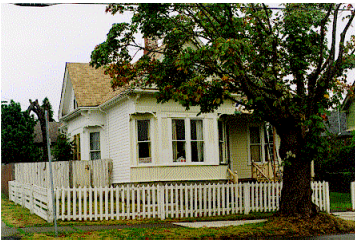
Name: Wood Residence Location: 133 Milton Street Date: 1896