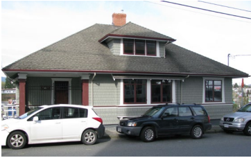
Name: Shaw Residence Location: 41 Chapel Street Date: 1921

Built in 1921 for Joseph H. and Florence Shaw, the residence is a very good example of late Craftsman style architecture. The house is notable for its refined handling of wood detailing. The overall cladding is cedar shingle, with twinned coursing to mark the foundation level. The exposed rafter ends, projecting brackets and the multi-paned casement windows with their tapered surrounds are all typical of the Craftsman style. The original front door, with its bevelled glass inserts and brass hardware, remains in place.