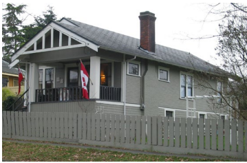
Name: Newbury Residence Location: 39 Milton Street Date: 1910

Prominently located on the corner of Millstone Avenue and Eberts Street, the residence is a highly visible landmark. The building is located in an established neighbourhood surrounded by mature, sympathetic landscaping within a larger grouping of housing from a similar era.