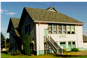
Name: Northfield School Location: 2249 Northfield Road Date: Early 1920s

Located on a narrow triangular lot between two main thoroughfares and at a major intersection, the Fire Hall is an important downtown gateway building and a highly visible landmark.