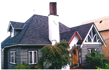
Name: Leynard Residence Location: 442 Milton Street Date: Circa 1932

This residence is part of a significant concentration of heritage buildings located in one of the City's oldest neighbourhoods, immediately adjacent to the downtown core.