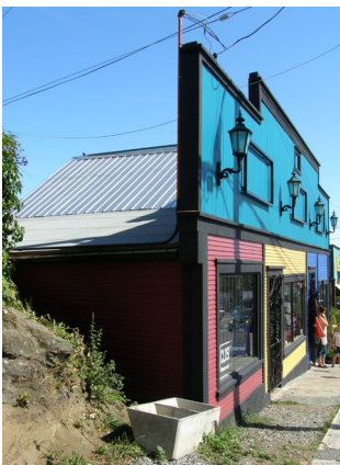
Name: Ranger's Shoes Location: 310 Fitzwilliam Street Date: Circa 1920

The building currently houses the Royal Canadian Sea Cadet Corps Amphion, which was formed in 1943. The corps was named after the HMS Amphion, a Royal Navy submarine active in World War II. The Sea Cadets first occupied the building in 1955 and have been at this location ever since. One of the last remaining buildings of the Nanaimo Military Camp, the building is now surrounded by parking and other buildings that form part of the Vancouver Island University campus.