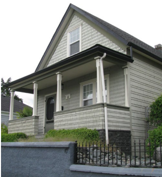
Name: Smith/Tait Residence Location: 16 Irwin Street Date: Circa 1888

The Smith/Wilson Residence is a good example of the type of housing that was built by the commercial class in an overwhelmingly working-class neighbourhood. While most of the adjacent houses are extremely modest, the Smith/Wilson Residence is relatively more ornate and testifies to the neighbourhood's housing and population diversity.