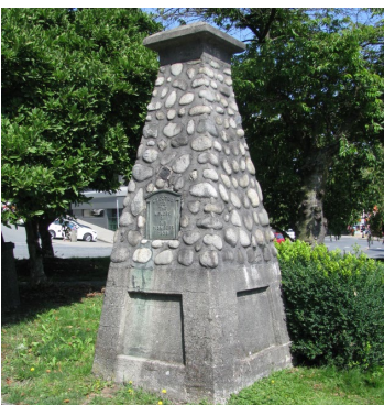
Name: Pioneer Square/Little Bastion Location: 28 Nicol Street