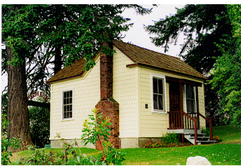
Name: Rowbottom Residence (now "The Miner's Cottage") Location: 100 Cameron Road Date: Circa 1897

The Nanaimo Centennial Museum is located on a prominent rock outcrop within the City's downtown core. Set in a municipal park that includes a miner's cottage and other mining-related artefacts, the Museum building is part of an integrated coal mining education and interpretive site.