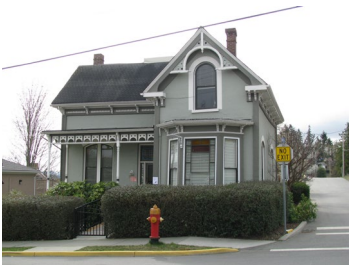
Name: Harris Residence Location: 375 Franklyn Street Date: 1898

The height of the Fourth Street Store Building, particularly in relation to the smaller residential buildings that surround it, and its siting very close to the street make it a neighbourhood landmark.