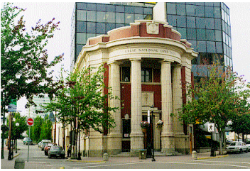
Name: Bank of Commerce (now Great National Land Building) Location: 5-17 Church Street Date: 1914

Sympathetically rehabilitated in 1997, the Bank of Commerce is Nanaimo's premier example of Classical Period Revival architecture. Built in 1914 during the 1912-1914 coal miners' strike, the building's classical conservatism represented tradition, stability and prosperity during a fractious and volatile period. Built to standards plans designed by Bank of Commerce staff architect Victor Horsburgh, the building transcends mere copying and responds dramatically to its prominent downtown corner location.