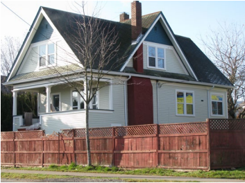
Name: McRae Residence Location: 98 Victoria Road Date: 1901

Built around 1913 for James Booth, a blacksmith for the Western Fuel Company, the residence is a good example the type of Edwardian era architecture popular during this period. Typical characteristics of this style include an asymmetrical facade, vertical proportions, full open-front verandah with square columns, and cross-gabled roofline. The building's solid, symmetrical and substantial appearance and minimal decoration reflects the era's move away from the ornamental excesses of the Victorian era.