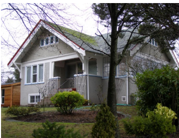
Name: Wells Residence Location: 904 Wentworth Street Date: 1911

The building is located within a popular park at the intersection of Machleary and Wentworth Streets.