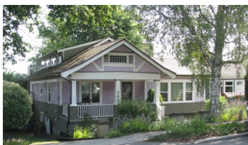
Name: Freethy Residence Location: 304 Kennedy Street Date: 1911

The building is prominently oriented to Kennedy Street and forms a unique part of a larger grouping of residential buildings in the city's old city quarter.