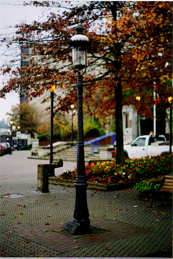
Name: Welsbach Gas Lamp Location: 85 Front Street

The Cenotaph is a very good example of a simple, graceful monument. Minimally ornamented, the Cenotaph's design, created and executed by local monument works owner E. Millins, was based on an ancient Egyptian model.