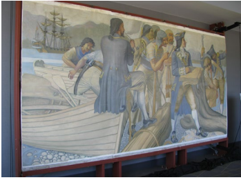
Name: EJ Hughes Mural Location: 100 Gordon Street Date: 1938 (restored in 2009)

The EJ Hughes Mural is an excellent example of a community-driven historic conservation project. From the summer of 1996 when the mural was first salvaged from the old Malaspina Hotel (38 Front Street) until the spring of 2009 when it was fully rehabilitated and installed in the Vancouver Island Conference Centre, numerous community groups, individuals and all three levels of government, most notably the City of Nanaimo, worked together to ensure project completion. The Hughes Mural restoration exemplifies Nanaimoites' patient determination and commitment to its heritage and public art.