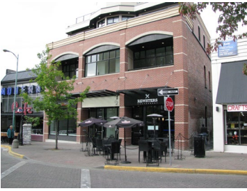
Name: Free Press Building Location: 223 Commercial Street Date: 1893 (façade rebuilt 1956)