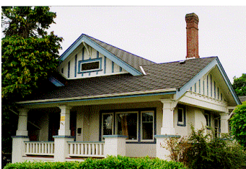
Name: Wilson Residence Location: 697 Wentworth Street Date: 1926

Located at an intersection within a grouping of significant heritage buildings, the Jenkins Building is a highly visible neighbourhood landmark.