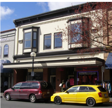
Name: Rogers Block Location: 83-87 Commercial Street Date: 1913

Situated in the middle of one city block of largely intact and similarly scaled buildings, the Hall Block is a significant part of the Commercial Street streetscape.