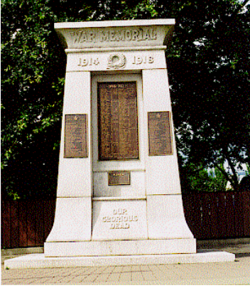
Name: Dallas Square Cenotaph Location: 85 Front Street

The Dallas Square Cenotaph, built in 1921 to commemorate local men who died during World War I, represents deeply felt community sensibilities about memory, war and loss. The Cenotaph is still used as a memorial site and bears witness to annual Remembrance Day ceremonies, giving the community an important opportunity to gather and remember together.