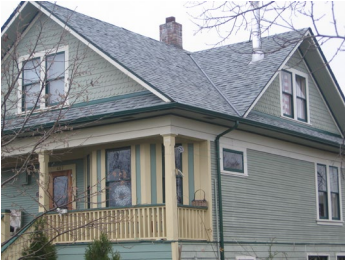
Name: Garland Farmhouse Location: 467 Eighth Street Date: Circa 1912