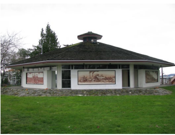
Name: Nanaimo Centennial Museum Location: 100 Cameron Road Date: 1967

Located on a major thoroughfare, Beban House gives Nanaimo one of few tangible links with its history in the north end of the city.