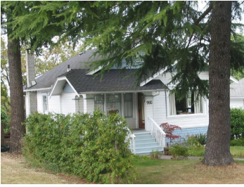
Name: Steel Residence Location: 990 Campbell Street Date: 1936

Built in 1936, the Steel Residence is a very good example of the type of modest, vernacular housing that was popular in Nanaimo during the depression. Interesting features of this Craftsman-inspired house include the jerkin-headed (clipped gable) roof, inset front porch and the decorative moulding and built-in cabinets in the living room. The house also features original light fixtures and door hardware. The house is substantially intact and has been very well maintained.