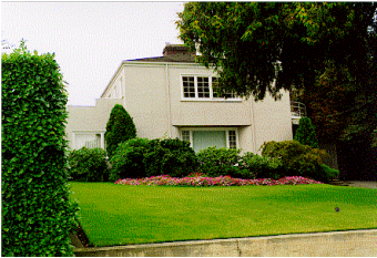
Name: Westwood / Giovando Residence Location: 225 Newcastle Avenue Date: Circa 1940

The Van Houten Residence is part of a significant grouping of heritage buildings in this neighbourhood.