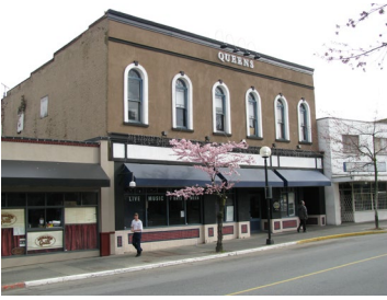
Name: Davidson Block (later the Queen's Hotel) Location: 34 Victoria Crescent Date: 1892

Built in 1892, the Queen's Hotel is a good, rare surviving example of the Italianate style, one of the most popular architectural styles of the nineteenth century. Although the hotel was substantially renovated in the 1980s and many of the original architectural elements were lost, the essential form and mass of the building are intact.