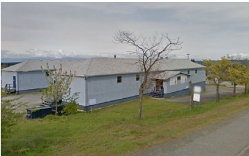
Name: Nanaimo Military Camp (Building #613) Location: 750 Fifth Street Date: Circa 1941

The Station's value resides in its location in one of the City's oldest mixed-use neighbourhoods, adjacent to the former site of one of the largest coal mining complexes in British Columbia history (the No. 1 Mine).