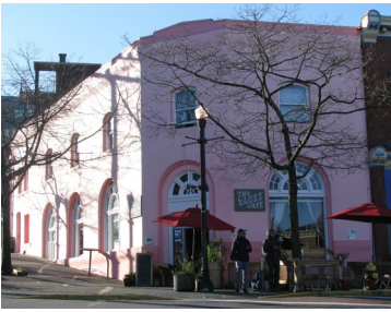
Name: Merchant's Bank of Canada Location: 499 Wallace Street Date: 1912

Built in 1912, the Merchant's Bank is Nanaimo's sole example of the eclectic, elegant Free Renaissance style, inspired by Italian churches and palaces, and popular in North America from the late 19th to early 20th centuries. The exterior was faced with a combination of a banded brick base and quoining that framed the edges and structural openings. A later coat of stucco obscured these features but some of the facade details, including the prominent cornices typical of this style, are still discernible. The elaborately detailed, round-arched windows, featuring radiating mullions and brick keystones, angled corner entry and ornate cast plaster ceiling are also substantially intact.