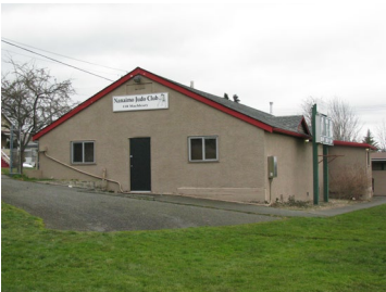
Name: Connaught Barracks Stable Location: 850 Wentworth Street Date: Circa 1915