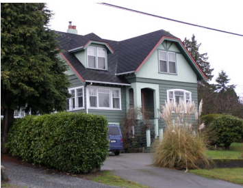
Name: Granby Mine Residence Location: 523 Vancouver Avenue Date: Circa 1918 (relocated circa 1935)

The Bird House is a rare surviving example of the type of prestigious housing that predominated in Newcastle Townsite from its first development just after 1900 until the 1940s. Separated from the rest of Nanaimo by the Millstone River, Newcastle Townsite quickly became an exclusive residential suburb for the city's commercial and professional elite. Today, the neighbourhood is a mix of commercial buildings, apartment buildings and single-family housing but surviving early residences such as this building are important evidence of the original character of the area.