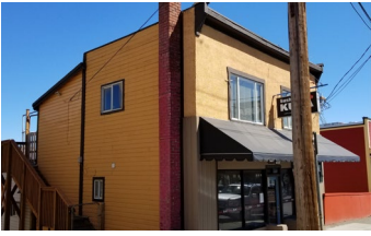
Name: Central Dairy Location: 428 Fitzwilliam Street Date: 1929