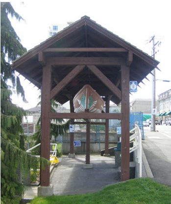
Name: Dugout Canoe Location: 6 Front Street

In the Victorian era most cities were illuminated by gas light. In 1817, Baltimore became the first city in North America to have gas street lights installed, but it was a number of decades before the technology improved sufficiently to become inexpensive and reliable. One of the great advances was a gas mantle invented in Heidelberg in 1885 by Carl Auer von Welsbach, a pupil of Professor Robert von Bunsen. Welsbach made a hood of finely woven long-staple cotton, saturated in rare earth oxides, that, when ignited over an upright Bunsen burner, provided illumination without a flame, and doubled the light level with half the amount of gas. The Welsbach mantle proved to be popular, and provided stiff competition to electrical illumination.