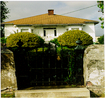
Name: Gilbert Residence Location: 279 Selby Street Date: 1893

Due to its mass, this building forms a prominent part of the Selby Street streetscape and is a visual reminder of an area abutting the railway that formed one of Nanaimo's earliest industrial zones.