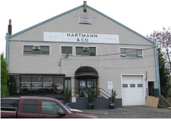
Name: Brackman-Ker Milling Building Location: 241 Selby Street Date: 1911

Originally built as the Brackman-Ker feedmill, this building is one of the few remaining pre-W.W.I. industrial structures in the City. Built in a utilitarian style, this is a good example of an early industrial building. The form of the structure is unchanged although upgrades have been made to the building exterior, with the most notable change being replacement of the building's original corrugated iron siding with vinyl siding.