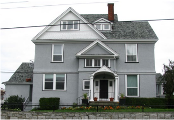
Name: Harrison Residence Location: 546 Prideaux Street Date: 1892

The house was built by its original owner, Walter Clements. Based on information available, it appears that Clements has no specific historical significance, nor does the building represent any particular historical trend. The residence is located on sloping topography forming the dividing line between two significant older City neighbourhoods – the Old City Neighbourhood to the east and the Harewood neighbourhood to the west. The residence is part of a concentration of heritage buildings in one of the City's oldest neighbourhoods, immediately adjacent to the downtown core.