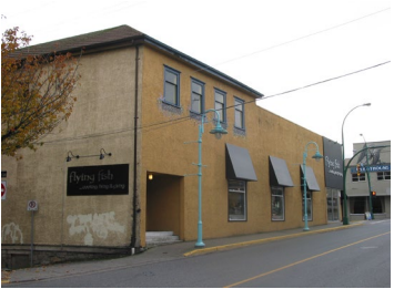
Name: A.R. Johnston & Co. Grocers Location: 172-174 Commercial Street Date: 1898