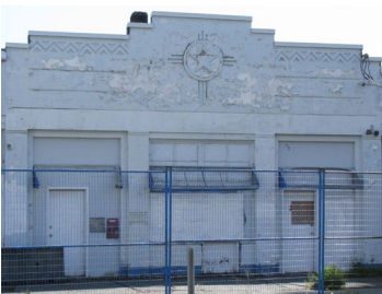
Name: Tom Brown's Auto Body Location: 28 Front Street Date: 1937

The Globe Hotel has been an important part of Nanaimo's social history for over a century. Like other hotels built during this period, the Globe provided an affordable housing option for the many single men that came to the City to work in the coalmines.