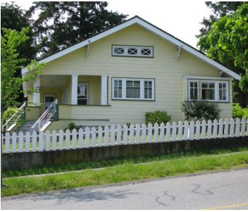
Name: Beattie Residence Location: 825 Fitzwilliam Street Date: 1910

Built in 1910, for George Beattie, owner of Beattie and Hopkins Printers, the Beattie Residence is a sophisticated and unusual example of an Edwardian-era Craftsman style bungalow. The building features many of the hallmarks of this style including its long and low proportions, double hung wooden-sash windows, front gable roof, inset verandah, squared chamfered columns, exposed rafter ends and triangular eave brackets. The building also has some unusual design elements including its tapered concrete foundation wall and an inset corner verandah without a supporting corner column. These eccentric features set the Beattie Residence apart from other Craftsman residences in the city.