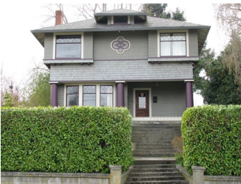
Name: Woodman Residence Location: 307 Kennedy Street Date: 1913

The residence speaks to the area's growth, after the turn of the 20th century, as a middle to upper income residential neighbourhood, a comfortable distance from the busy commercial core and adjacent mixed-use neighbourhoods.