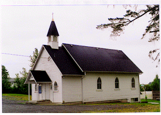
Name: Our Lady of Good Counsel Roman Catholic Church Location: 4334 Jingle Pot Road Date: 1938

Built in 1938, the Our Lady of Good Counsel Roman Catholic Church building is a very good example of Gothic Revival architecture, a popular style for churches in this period and typified by its overall vertical emphasis and pointed arch windows. The building's modest proportions and minimal ornamentation reflect its construction during the Depression.