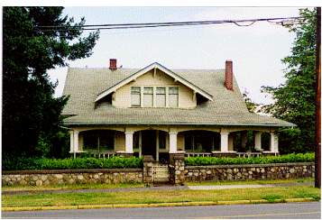
Name: Rowbottom Residence Location: 320 Machleary Street Date: 1913