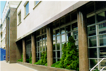
Name: Nanaimo Post Office & Federal Building Location: 54-66 Front Street Date: 1954

The Nanaimo Court House is also significant because of its siting on the lot. The mid-block location was an unusual choice, as most courthouses were given a prominent corner location. To increase the formality of the design and the presence of the building, the building is set to the rear of the sloping site. This position allowed for a gracious landscaped plaza at the front.