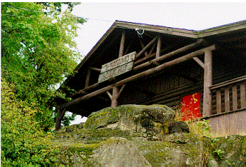
Name: First Nanaimo Scout Hut Location: 445 Comox Road Date: 1930

The building forms part of a significant cluster of heritage buildings located at the intersection of Commercial, Church and Chapel Streets and has a prominent street presence due to its location flush with the Commercial Street right-of-way.