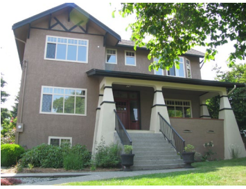
Name: Bird House Location: 461 Vancouver Avenue Date: 1914

Built in 1914, the Bird House is a good example of a Craftsman style home. The house features many design elements typical of this style including half timbering in the gable ends, triangular eave brackets and an open front verandah supported by flared piers. Although the original wood siding has been covered by stucco and most of the original windows replaced or modified, the building is otherwise substantially intact. Of particular note, many of the home's original interior features are intact including the wainscoting, dramatic staircase, art glass windows, built-in sideboard in the dining room, built-in bookcases in the den, cast iron radiators (still in use) and the inlaid oak floors.