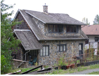
Name: Clements Residence Location: 420 Pine Street Date: 1929

Built in 1929, the Clements Residence is a good example of an unusual, vernacular late-Craftsman style building. While the simple form, steeply pitched roof and shed dormer are typical Craftsman elements, the extensive use of rock is an idiosyncratic and unusual surface treatment.