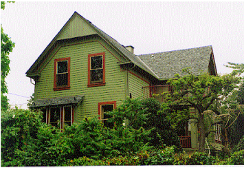
Name: Wilton/Welch Residence Location: 129 Milton Street Date: 1903

Built in 1903 and expanded in 1916, the Wilton-Welch Residence is a very good example of a vernacular, Edwardian era building. The simple, L-shaped plan has an overall restrained appearance that is enriched by carpenter ornamentation including scroll-cut eave brackets and contrasting tongue-and-groove in detailing in the front gable and along the eave lines. A major rear addition in the 1970s does not significantly impact the overall appearance of the house.