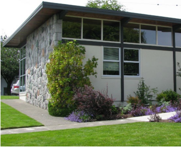
Name: Vancouver Island Regional Library Location: 580 Fitzwilliam Street Date: 1961

The Vancouver Island Regional Library is a very good example of West Coast vernacular style. Developed after World War 2, this regional style typically used post and beam construction which allowed for greater freedom in the positioning of windows and partitions than did standard stud construction. The style's modern ambience was appropriate for new institutional buildings such as libraries.