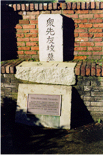
Name: Garden Memorial to Chinese Pioneers Location: 105 St. George Street Date: Circa 1890

The Garden Memorial to Chinese Pioneers speaks directly to Nanaimo's Chinese heritage. Around 1890, this small plot was donated by the New Vancouver Coal Mining and Land Company for use as a Chinese burial ground. At that time, the site was just beyond the city's official boundaries. Bodies were interred here, but it was always intended that the bones of the deceased would be returned to China. The site was in use until 1924, when the new burial grounds on Townsite Road were established. This site served as an essential communal space for the original Chinese community and, later, as an important commemorative space for their descendants.