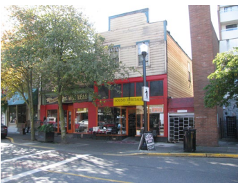
Name: Victoria Crescent Commercial Building Location: 33-35 Victoria Crescent Date: Circa 1892 or earlier