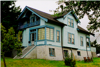
Name: Park Avenue Residence Location: 465 Park Avenue Date: Circa 1913

The residence represents the continuing suburban development of this area north of the downtown core and a move towards a modern design aesthetic. The residence is also significant as the childhood home of internationally known jazz singer Diana Krall.