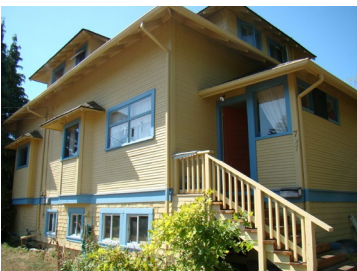
Name: Girvin Avenue Residence Location: 797 Girvin Avenue Date: Circa 1912