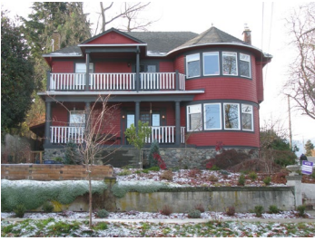
Name: Wilkinson Residence Location: 305 Kennedy Street Date: 1913

Built in 1913, the Wilkinson Residence is Nanaimo's premiere example of the eclectic design trends of the Edwardian era. The Craftsman-influenced river rock foundation, Classical style porch columns and Edwardian era vertical proportions of the building are evidence of this trend. The building is further distinguished by a two-storey high rounded turret on the front façade, stained glass window panels and sidelights and a roofed second floor balcony.