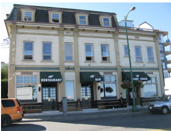
Name: Globe Hotel Location: 25 Front Street Date: 1887 (rear addition 1913) (side addition 1936)