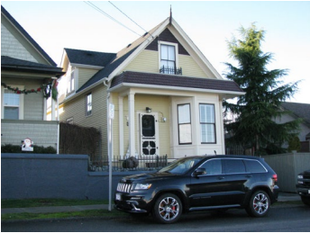
Name: Smith/Wilson Residence Location: 12 Irwin Street Date: Circa 1889

Located near the Bowen Road Cemetery, the residential property forms part of the historical Fairview neighbourhood, and is believed to be one of the oldest residences in this area. The residence forms part of a grouping of similar era housing with mature landscaping along this portion of Howard Avenue, distinctly contrasting with the post-modern era housing stock located directly across the street.