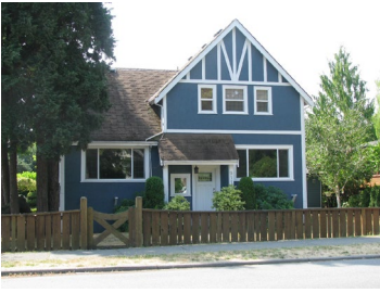
Name: Ivers/Honey Residence Location: 911 Wentworth Street Date: Circa 1939

Built around 1939, the Ivers/Honey Residence is a very good example of a vernacular, English-Cottage style building. Although there have been some changes to the exterior over time, most notably the stucco cladding and replacement windows and doors, the basic form and integrity of the building remains intact.