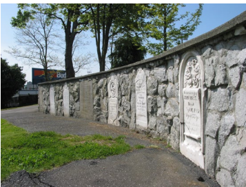
Name: Pioneer Cemetery Park Location: 10 Wallace Street Date: circa 1853

Built in 1924, the Chinese Cemetery is a very good example of an ethnic cultural landscape. In addition to grave markers with Chinese inscriptions, the cemetery features traditional Chinese elements including ornate, brightly painted entry gates, a pagoda structure, an altar and a shrine. Although the cemetery is no longer exclusively Chinese, it retains, through the presence of these elements, a distinct Chinese character. The Cemeteries' striking entrance gates and its location on a main thoroughfare make it a highly visible neighbourhood landmark.