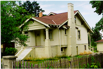
Name: Beck Residence Location: 610 Selby Street Date: 1921

The Manson Residence is a very good example of the stylistic evolution of a building over time. The original part of the house was a typical, modest Nanaimo worker's cottage, built between 1885 and 1887. The worker's cottage form is still clearly visible at both sides of the house. Subsequent renovations include the addition of a full front verandah with front gable and late-Victorian posts and a large rear addition. Although modern metal windows and doors have been introduced, the essential character of the building remains intact and the building is well maintained.