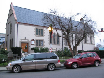
Name: St. Paul's Anglican Church Location: 100 Chapel Street Date: 1931