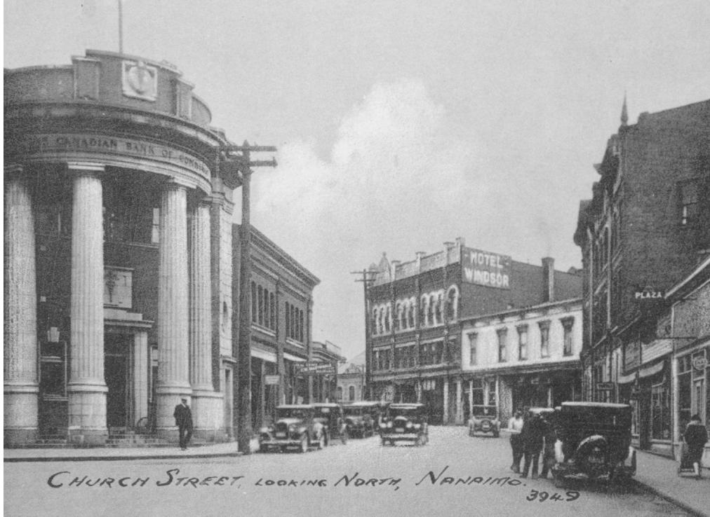
Church Street, Nanaimo BC (circa 1920s)