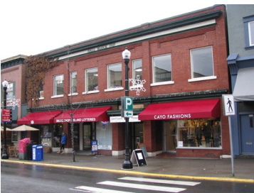
Name: Hall Block Location: 37-45 Commercial Street Date: 1925

Built in 1908, the Caldwell Block is a good example of a modest, vernacular Edwardian style commercial building. The original brick façade is obscured by stucco but some of its features, including a cornice with brackets and moulded fascia, are still visible. Traces of the painted Caldwell's Clothing House sign, which occupied the building from at least 1920 until the late 1930s, are visible on the building's east side. Despite alterations, the building has maintained its character and reinforces the Edwardian era appearance of the west side of Commercial Street.