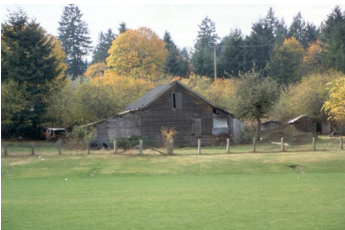
Name: Stark's Barn Location: 1526 Extension Road Date: Circa 1880

Built around 1912, the farmhouse is a very good example of an Edwardian bungalow. Characteristics of this style include the simple, boxy form, horizontal lapped, twin bevelled wooden siding, double hung wooden sash windows, stained glass in living room window, cross gable roof, side gable dormers with hip returns, and full open front verandah with square chamfered columns. The building's solid, substantial appearance and minimal decoration reflects the era's move away from the ornamental excesses of the Victorian era and its function as a working farmhouse.