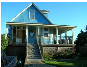
Name: Simpson Residence Location: 18 Albion Street Date: 1921

This tall house reflects the verticality of the Queen Anne style. A two storey projecting bay runs up the full height of the front façade, and is decorated with 'fishscale' shingles and scroll-cut brackets. There are arched windows in the front gable and in the panelled front door. The large lot retains some early landscape features, including mature shrubs and hedges. The house was built by William Morrison, a tailor, on land acquired from Andrew Haslam; it is unknown if Morrison ever lived here.