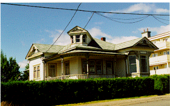
Name: Sullivan Residence Location: 673 Selby Street Date: Circa 1892