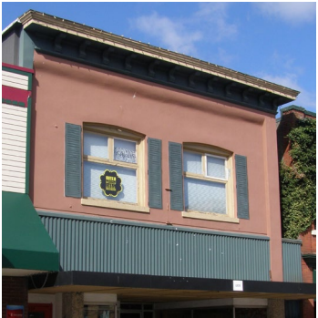
Name: Caldwell Block Location: 35 Commercial Street Date: Circa 1908

The building is significant as part of a continuous line of similarly scaled and largely intact historic buildings located on the west side of Commercial Street.