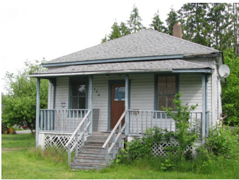
Name: Rowley Residence Location: 426 Machleary Street Date: 1893

The Meredith Road Residence is significant as one of the few remaining early buildings in an area that, until amalgamation with the City of Nanaimo in 1975, was a distinct community. Originally developed as a coalmining town in the late 19th century, Northfield enjoyed a brief resurgence in the late 1930s. In addition to coal mining, small-scale farming, dynamite manufacturing and other businesses were developed. Amalgamation and development between separate coal towns eventually blurred the distinctions among them. The Meredith Road Residence serves as a physical reminder of the area's original development as a distinct community.