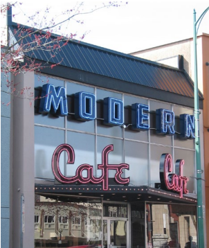
Name: Modern Café Location: 221 Commercial Street Date: 1910 (façade rebuilt 1950s)

Illustrating Nanaimo's early commercial development, the A.R. Johnston Block is one of very few pre-1900 buildings still standing. The building was part of a complex that included a store, warehouse and wharf and originally backed onto Nanaimo's now infilled inner harbour. The siting underlines the historic importance of harbour access and water transportation to early merchants operating in isolated Nanaimo.