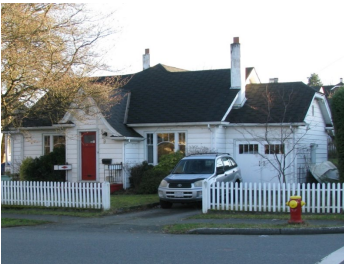
Name: Tuck Residence Location: 959 Wentworth Street Date: Circa 1936

Located on a corner lot within one of Nanaimo's oldest neighbourhoods and prominent to the street with mature landscaping, this residence forms part of a grouping of historic residential buildings adjacent to the downtown core.