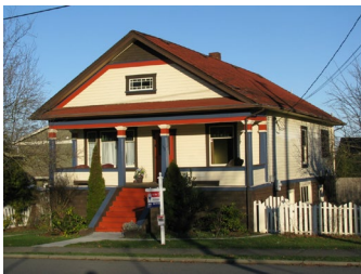
Name: Cowman Residence Location: 150 Kennedy Street Date: Circa 1918

The Church building is significant as an example of building preservation. Originally located in Lantzville, just north of Nanaimo, the building was moved to its current location and maintained in mostly original condition, including much of the interior.