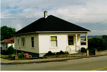
Name: Hayes Residence Location: 703 Haliburton Street Date: Circa 1920

Built around 1920 for Jack Hayes, the residence is a superior example of the type of simple bungalow that proliferated in Nanaimo's working-class neighbourhoods. The form is reduced to the essentials; a hipped roof caps a rectangular plan, relieved by an inset entry porch with square chamfered columns. Otherwise minimally embellished, the coloured art glass panels used in the upper window sash provide some relief from austerity.