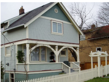
Name: John Johnston Residence Location: 407 Machleary Street Date: Circa 1912

The Hitchen Residence is part of a grouping of superior heritage buildings, located in one of the city’s oldest neighbourhoods adjacent to the downtown core.