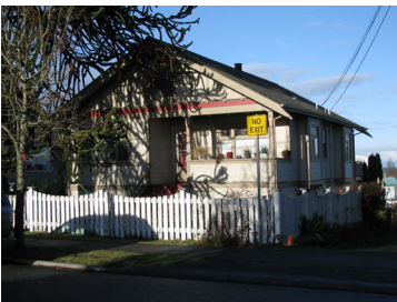
Name: Pargeter Residence Location: 536 Kennedy Street Date: 1913

The residence is part of a grouping of superior houses that exemplifies the neighbourhood's early identity as a prestigious residential area.