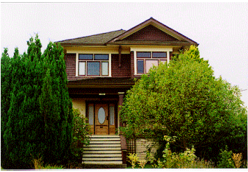
Name: Dykes Residence Location: 639 Kennedy Street Date: 1904

Built in 1913, the Layer-Hall Residence is an excellent example of an Edwardian building with Foursquare and Craftsman influences. The Four square's box plan made it economical and practical to build and the simple design typifies restrained, Edwardian elegance. The Layer-Hall Residence's basic box plan is embellished with Craftsman details including large eave brackets and leaded and stained glass wooden sash casement windows. Although a rear addition alters the original square configuration, the building is substantially intact.