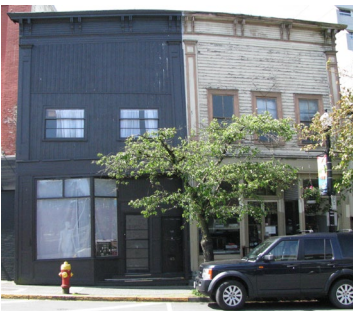
Name: Nanaimo Pioneer Bakery/Johnson's Hardware Location: 39-45 Victoria Crescent Date: Circa 1870s

Located mid-block, Queen's Hotel is prominent on the street and is part of a grouping of historic buildings in this area.