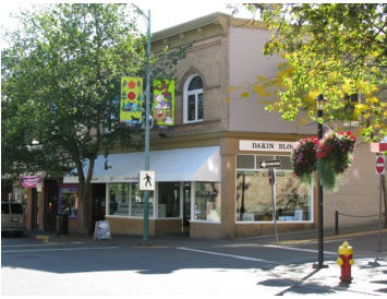
Name: Hirst Block (now Dakin Block) Location: 93-99 Commercial Street Date: 1911

Built in 1911, the Hirst Block is a superior example of the Edwardian-era commercial building style in Nanaimo. The front façade is beautifully detailed with elaborate tan-coloured brickwork and a projecting pressed metal cornice. Three round-arched windows on the second floor have decorative bevelled glass in the upper sash. The building was sensitively rehabilitated as part of a 1985 Downtown Revitalization program.