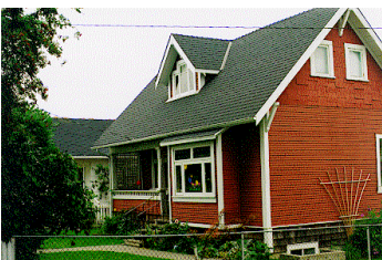
Name: Craig Street Residence Location: 112 Craig Street Date: Circa 1912

Located on a high rocky outcrop in a municipal park, the building is a highly visible symbol of the scouting movement in Nanaimo and, by extension, the continuing importance of local organizations to the vitality and richness of community life.