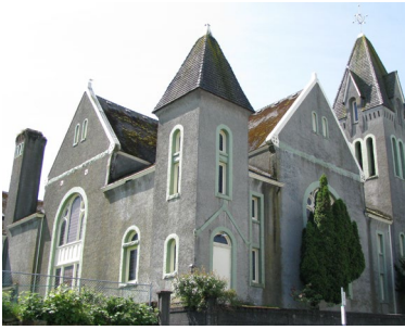
Name: St. Andrew's Presbyterian Church (now St. Andrew's United Church) Location: 315 Fitzwilliam Street Date: 1893 (church hall constructed 1927)

Built in 1893, St. Andrew's United Church is a good example of Late Victorian church architecture. The church follows the square floor plan with second floor horseshoe gallery typical of Late Victorian Presbyterian churches, its original denomination. A large hall at the rear, built in 1927, features a two-storey auditorium with a balcony. The church retains much of its original character despite some later alterations, most notably a stucco finish over the original brick walls.