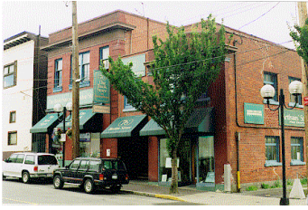
Name: BC Telephone Exchange Location: 70-76 Bastion Street Date: 1908

The first private telephone system in British Columbia ran from the Dunsmuir Mine at Wellington to the dock at Departure Bay. The Nanaimo Telephone Company was incorporated in 1890, and the first Telephone Exchange was located in the Cavalsky Store, with Laura Cavalsky acting as operator. From 1893 until 1908 it operated from the building on Commercial Street that later housed the Daily Free Press. The Nanaimo Telephone Company merged with B.C. Telephone, and from 1908 until 1960 the exchange was located at 76 Bastion Street. B.C. Telephone introduced the busy signal in Nanaimo in 1955, and direct dialling in 1957.