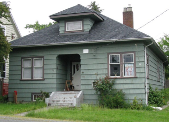
Name: Spence House Location: 746 Railway Avenue Date: Circa 1912

Built between 1900-1910, the Rosehill Street Residence is a very good example of an early vernacular worker's cottage, which represented the Nanaimo area's predominant housing form from around 1900 to 1920. Inexpensive to build, the typical worker's cottage features a simple square plan, pyramidal roof and lack of ornamentation. A feature unique to this building is its recessed entrance alcove.