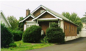
Name: Sharp Residence Location: 261 Vancouver Avenue Date: 1923

The Schetky Residence's grounds represent the type of landscaping that was favoured for Nanaimo's upscale neighbourhoods in the late 19th and early 20th centuries. The mature Chilean Pine (Monkey Puzzle Tree) on the site is listed on the City's register of heritage trees. These trees were a popular fad before World War 1 and were often brought in by ship's crews as souvenirs when they stopped to refuel in South America. Often given as gifts, they were planted singly or in pairs in front yards. Other landscape features include mature holly trees, lilac bushes, rose bushes along the walk and a Japanese Plum. The grounds have a historical and physical relationship to the building and, as such, are an important component of the site's value. The residence's location at a busy intersection and the massive Chilean Pine in the front yard make it a neighbourhood landmark.