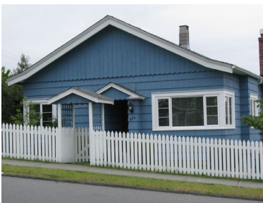
Name: Priestly Residence Location: 824 Fitzwilliam Street Date: 1895

The Shaw Residence is part of a significant cluster of exceptionally intact and well maintained historic buildings in this neighbourhood.