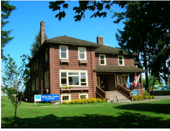
Name: Beban House Location: 2290 Bowen Road Date: 1930