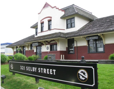
Name: Esquimalt & Nanaimo Railway Station Location: 321 Selby Street Date: 1920

This Late Victorian cottage survives mostly in its original configuration (a second floor was removed), and is one of the best surviving examples of this type of house in Nanaimo. Square and symmetrical in design, with a central front entry, it is covered with a pyramidal roof that extends over the paired front bays to form a small porch. The front bays display decorative carved brackets at the eave line. The front door is original, with arched top panels, and retains its sidelights and transoms. The Gilbert Residence still sits on its original large property, with many mature shrubs and landscape features typical of the period, including variegated hollies. One of the most remarkable features is the unique wrought iron front gate and gateposts, manufactured by the Stewart Company of Cincinnati, Ohio; decorative cast metal was generally removed from older houses during the Second World War as a result of 'scrap metal drives'.