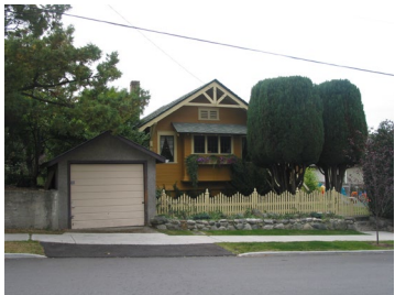
Name: Young/Pargeter Residence Location: 45 Milton Street Date: 1911