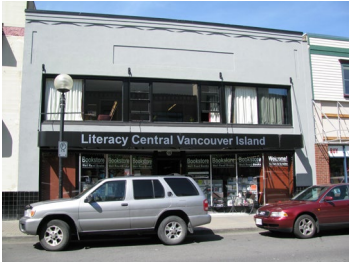
Name: Nash Hardware Location: 19 Commercial Street Date: 1909