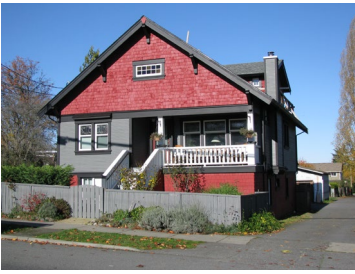
Name: Crossan Residence Location: 718 Wentworth Street Date: 1912