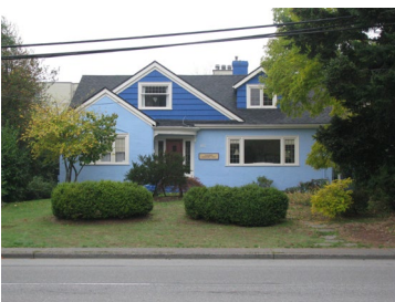
Name: Daniel Galbraith Residence Location: 185 Stewart Avenue Date: Circa 1890