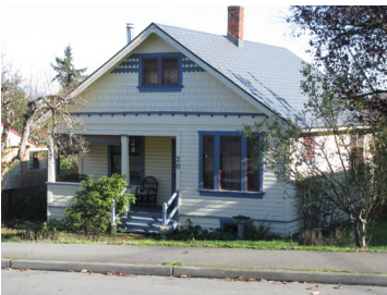
Name: Pine Street Bungalow Location: 20 Pine Street Date: Circa 1918

This striking house is very similar to 746 Railway Avenue, and to 648 and 650 Haliburton Street; these four houses were most likely built by the same builder. The sophisticated design has highly unusual features, including the battered foundation skirting, and the scalloped inset arch over the second floor front and rear balconies. The ornamentation includes scroll-cut vergeboards, and brackets under the projecting side bay. There are inset corner porches at the front and rear, with square chamfered columns. This house was built on a lot subdivided as part of the 'Brookside' subdivision in 1912.