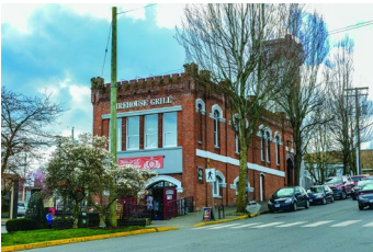
Name: Nanaimo Firehall #2 Location: 34 Nicol Street Date: 1893

The Residence's waterfront location, exceptional condition and its unusual style make it a highly prominent landmark.