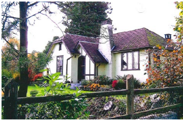
Name: Beevor-Potts Residence Location: 627 Millstone Avenue Date: Circa 1930

Built around 1930, the Beevor-Potts Residence is a very good example of the English Cottage Style that was very popular in Nanaimo during the interwar period. Design features representative of this style include the asymmetric floor plan, jerkin headed and steeply pitched gable roofs and the early use of stucco siding. The building is substantially intact.