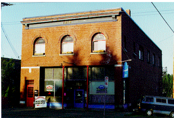
Name: Hoggan's Store Location: 404 Stewart Avenue Date: 1914

Prominently located at the corner of Stewart Avenue and Mt. Benson Street, this residence formed part of a larger concentration of heritage buildings comprising the Newcastle Townsite and is a highly visible neighbourhood landmark. The building is surrounded by mature, sympathetic landscaping which features a row of mature Copper Beech trees located on the adjoining Mt. Benson Street right-of-way.