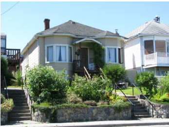
Name: Milton Street Bungalow Location: 469 Milton Street Date: Circa 1892

The building is very prominent on the street and surrounded by sympathetic landscaping.