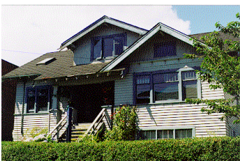
Name: Reid Residence Location: 151 Skinner Street Date: 1921

The ornate and unusual Sullivan Residence, located on a gently sloping site, is a neighbourhood landmark.