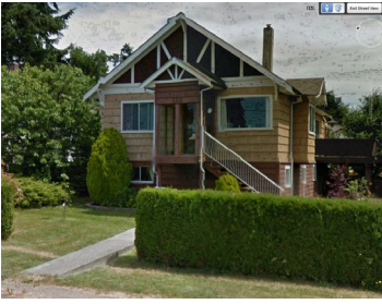
Name: Lewis Residence Location: 130 Howard Avenue Date: Circa 1911

Built around 1911, this residence is a good example of an Edwardian era bungalow, with many of the features typical of this style including a simple, rectangular form, cedar shingle siding, and restrained ornamentation. Originally constructed as a one storey building, the overall original building form is substantially intact, although the residence's original wood frame windows have been replaced and the front entrance significantly altered.