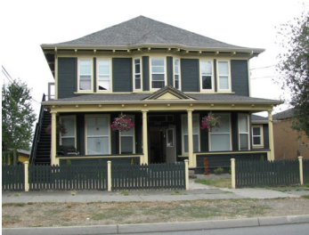
Name: Rowe Residence Location: 545 Haliburton Street Date: Circa 1906

Located prominently to Haliburton Street this is a relatively intact reminder of the type of housing that once dotted this area of Nanaimo and provided housing for the miners' and their families.