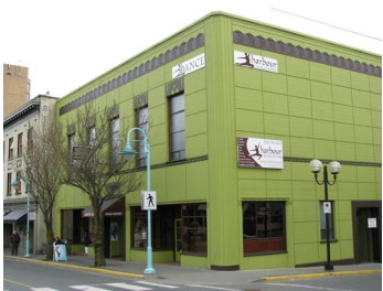
Name: Eagle's Hall Location: 133-41 Bastion Street Date: 1934

Designed by architects Breseman and Durfee, who also designed Victoria's First Congregational Church and St. James Hotel, the Commercial Hotel is a very good example of the Edwardian Commercial style and features the simplicity and overall restrained appearance typical of this style. Despite some alterations, much of the building's original character is intact, including the brick facing, projecting metal cornices and storefront piers.