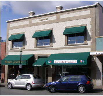
Name: Parkin Block Location: 143-155 Commercial Street Date: 1922

Designed by local architect and contractor Daniel Egdell and built in 1922, the Parkin Block is a very good example of the type of vernacular commercial building built in downtown Nanaimo just after the First World War. The building continues the traditional appearance of the Edwardian-era but has a more eclectic façade treatment. Predominantly stucco, the façade is highlighted by simple brick detailing that outlines the edges of the building and structural elements.