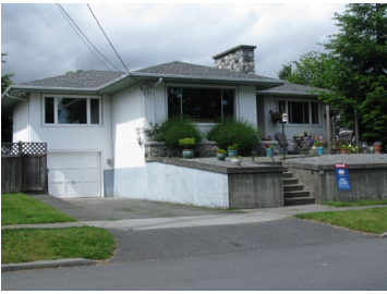
Name: Hitchen Residence Location: 395 Machleary Street Date: 1952

Built in 1952, the Hitchen Residence is a very good example of early ranch house design and displays many elements typical of the style including a long and low profile, rock trim on the exterior, a low-pitched roof, large picture windows and deeply overhanging eaves. The street-facing porch, so popular in earlier bungalows, is replaced here by a discreet entryway and street facing garage, another typical Ranch style element. Inside, the original highly coloured bathroom tiles and fixtures, airy living areas and intact kitchen are delightful reminders of the “modern” decade.