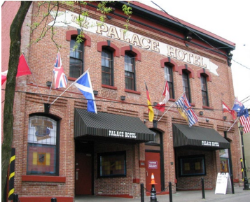
Name: Palace Hotel Location: 275 Skinner Street Date: 1889

Built in 1889, the Palace Hotel is a very good example of the Italianate style, one of the most popular nineteenth century architectural styles in North America. The Palace Hotel was one of the earliest of the new type of hotels that was built during this era. It marks the beginning of a transition from the City's early rough, pioneer type architecture to a more refined and elegant style. Although there have been numerous renovations over the years, the building retains much of its original character.