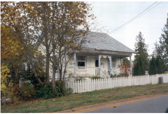
Name: John Wilson Residence Location: 18 Fourteenth Street Date: Circa 1890

The Beattie Residence is significant as an example of the type of superior housing, both in design and construction, that typifies this neighbourhood. By the turn of the 20th century, this area was established as a middle to upper income residential neighbourhood a comfortable distance from the busy commercial core and adjacent mixed-use neighbourhoods.