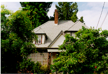
Name: Ekins Residence Location: 441 Vancouver Avenue Date: 1927