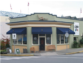
Name: Rawlinson & Glaholm Grocers Location: 437 Fitzwilliam Street Date: 1916

The Occidental Hotel has been in continuous use as an eating and drinking establishment for over 100 years.