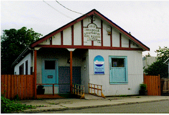
Name: Provincial Government Mine Rescue Station Location: 1009 Farquhar Street Date: 1913

Built in 1913, the Provincial Government Mine Rescue Station is a good example of a vernacular, utilitarian building and one of the oldest known local uses of corrugated iron cladding.