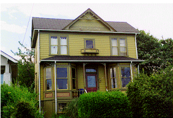
Name: Ledingham Residence Location: 347 Milton Street Date: 1902