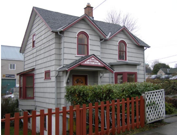
Name: Aldred House Location: 529 Wentworth Street Date: Circa 1890

The building's prominent corner location and exceptional windows make it a highly visible landmark.