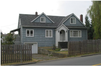
Name: Crewe Residence Location: 624 Wakesiah Avenue Date: 1900

Built in 1937, the Gulliford Residence is an excellent example of the vernacular English Cottage style that flourished in Nanaimo in the interwar years. Simple in form, the building is embellished by leaded glass windows, dormers, and an arched front, projecting entry-way rendered in stucco. The building is also significant as an example of the development of in-house garages during this period. The building's prominent corner location at a busy intersection makes it a highly visible neighbourhood landmark.