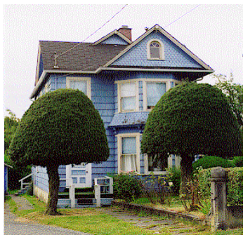
Name: Holland/Morrison Residence Location: 763 Albert Street Date: Circa 1896

Located on a corner lot, the Nanaimo Maternity Home building is part of a group of heritage buildings in this section of one of Nanaimo's oldest neighbourhoods adjacent to the downtown core.