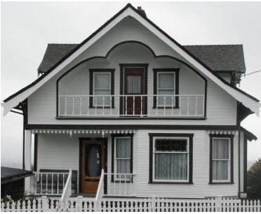
Name: Oikari Residence Location: 1343 Quinn Lane Date: Circa 1912