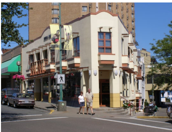
Name: Gusola Block Location: 120 Commercial Street Date: Circa 1937