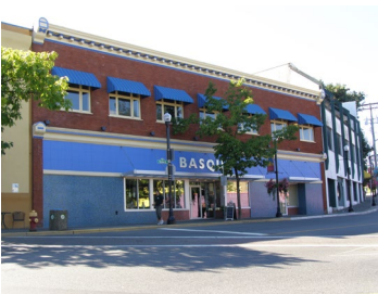
Name: Brumpton Block Location: 481-489 Wallace Street Date: 1912

The gardens at the side and front of City Hall were designed at the same time as the building and are integral parts of the site's value. Situated on a high rocky outcropping, the extensively landscaped grounds soften the rigid formality of the building's architecture. The winding roadway that leads to the front entry provides a welcoming entrance, appropriate to a public building.