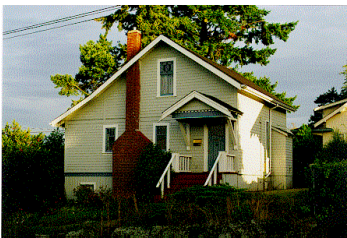
Name: Shaw Residence Location: 815 Fitzwilliam Street Date: 1910

The Vancouver Island Regional Library speaks to the municipal government's earliest attempt to streamline community services for efficiency and easy public access. By the mid-1960s, the police station, health unit, library and fire hall were all located in what was historically known as Lubbock Square, just outside the downtown core. The library and health unit have since moved to other locations. The fire hall and main police station remain and are tangible reminders of the area's early importance as a central location for most of the city's protective and community services.