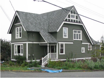
Name: "Fernville" (The Land Residence) Location: 167 Irwin Street Date: Circa 1890

Built around 1890, Fernville is a very good example of a picturesque Late Victorian building. Tall and imposing in massing, the house features a cross-gabled roof. The ground floor is clad in drop siding; the second floor in bellcast shingling. The corner entry porch is supported on a single, turned column. Coloured glass insets exist in the corners of some of the windows.