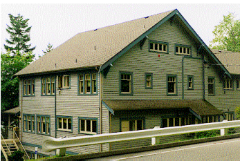
Name: Pacific Biological Station Residence Location: 3190 Hammond Bay Road Date: 1928

The Haliburton Street Residence is located prominently on the main thoroughfare of one of the oldest neighbourhoods in Nanaimo.