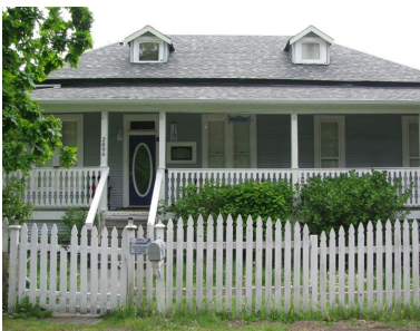
Name: 105 th Street Residence Location: 2896 105 th Street Date: 1910

Surrounded by mature, sympathetic landscaping, the residence is part of a significant concentration of heritage buildings located in one of the City's oldest neighbourhoods, immediately adjacent to the downtown core.