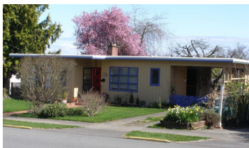
Name: Cunningham Residence Location: 190 Kennedy Street Date: Circa 1961

Located opposite Gyro Park, the building is part of a significant concentration of heritage buildings located in one of the City's oldest neighbourhoods, immediately adjacent to the downtown core.