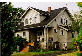
Name: Pine Street Residence Location: 259 Pine Street Date: Circa 1913

The building is located on a busy thoroughfare in one of the City's oldest neighbourhoods, immediately adjacent to the downtown core, and surrounded by mature, sympathetic landscaping.