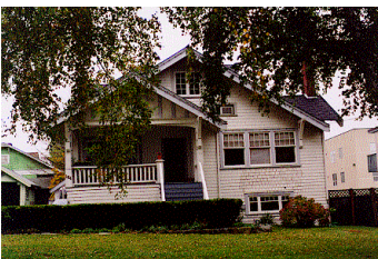
Name: Galbraith Residence Location: 164 Mount Benson Street Date: 1923

The Milton Street Bungalow is located on a half-lot within a grouping of heritage buildings in of the City's oldest neighbourhood. While rare in other parts of the City, half-lots are a defining feature of this block of Milton Street. The building is part of a significant concentration of heritage buildings located in one of the City's oldest neighbourhoods, immediately adjacent to the downtown core.