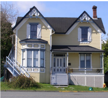
Name: Young Residence Location: 102 Fry Street Date: Circa 1890

Behind the Bastion a flight of steps leads down to the spot where the "Princess Royal Pioneers" landed in 1854 after a six month's voyage around Cape Horn. The site is marked by a cairn and plaque on Pioneer Rock.