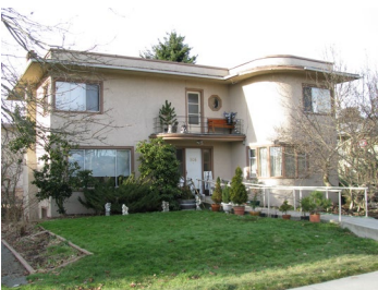
Name: York Residence Location: 908-912 Hecate Street Date: 1948

Built in 1928, the Pacific Biological Station Residence is an unusual, very good example of a vernacular institutional building with Craftsman style influences. A tall, rambling structure set into a hill, the building has a large wraparound verandah on the main floor that faces the water view. Triangular eave brackets provide a decorative note to an otherwise plain and functional structure. Also on the site is a small structure, probably built as a picnic shelter and now used as a bicycle shelter. It was designed in a rustic style with a concrete base clad with rounded stones and a peeled log superstructure.