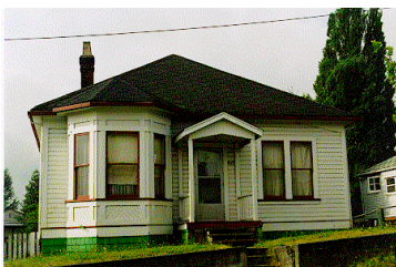
Name: Adams Residence Location: 547 Kennedy Street Date: 1908

The residence is part of a grouping of heritage buildings in this section of one of Nanaimo's oldest neighbourhoods, adjacent to the downtown core.