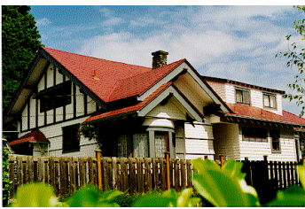
Name: Johnston Residence Location: 36 Stewart Avenue Date: 1912

The Palace Hotel represents the social importance of hotels in Nanaimo history. Like most mining communities, early Nanaimo had a large population of single, often transient, men. As affordable housing alternatives, hotels functioned as living quarters and, in the saloons and restaurants typically located on the ground floor, as social centres. The value of the Palace Hotel lies in location at the bend of a curvilinear, narrow lane that intersects with the main downtown thoroughfare. The view to the Palace Hotel is framed by landmark historic structures on the main street. The hotel itself partially closes the vista from the main street and acts to create a feeling of intimacy and seclusion.