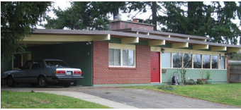
Name: McCannel Residence Location: 757 Northumberland Avenue Date: Circa 1950

Built around 1950, the McCannel Residence is a very good, early example of the popular post-WWII Suburban Ranch style. The influence of architect Frank Lloyd Wright and Japanese architecture is very apparent in the design. The building displays many elements typical of this style including low pitched roofs which emphasize the form's horizontality, broad central chimneys without ornamentation, asymmetrical façade, exposed trusses, attached garage, linear window rows, and brick exterior. The Suburban Ranch style was the favored design in suburban tract developments from the late 1940s into the 1970s.