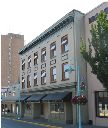
Name: Commercial Hotel Location: 121 Bastion Street Date: 1913

The B.C. Telephone Exchange building is a very good example of a vernacular Edwardian style commercial building and is significant as an early example of the adaptive reuse of buildings to suit corporate needs. The façade redevelopment modernized the building and projected a more utilitarian, progressive image, appropriate for a service provider, than the original elaborate façade.