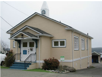
Name: Christian Science Society Building Location: 20 Chapel Street Date: 1932

The Provincial Liquor Store is evidence of Nanaimo's post Second World War economic renewal and represents, in its striking modernity, a shift towards a different aesthetic in the downtown core.