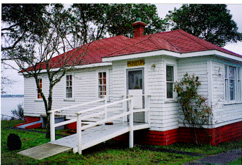
Name: Gallows Point Lighthouse Keeper's Cottage Location: 208 Colvilleton Trail Date: Circa 1912

The Bank of Commerce is an important intact example of the type of bank architecture that predominated throughout Canada during the late 19th and early 20th centuries.