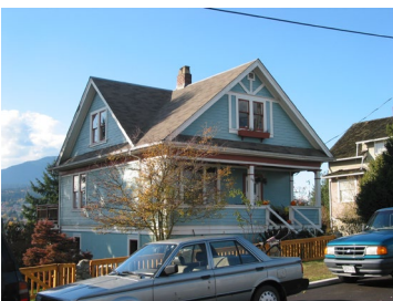
Name: Parrot Residence Location: 411 Machleary Street Date: 1916

The Johnston Residence is part of a grouping of heritage buildings in one of the City’s oldest neighbourhoods, adjacent to the downtown core. The residence is located on a sloping lot with sympathetic modern planting and an excellent view of Harewood.