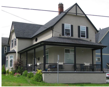
Name: Nanaimo Maternity Home Location: 512 Albert Street Date: Circa 1915

The Nanaimo Maternity Home building is a good example of a vernacular, Edwardian era building. The simple, L-shaped plan has an overall restrained appearance. Although there have been some changes to the exterior over time, most notably the stucco cladding and replacement windows, the basic form and integrity of the building remains intact.