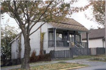
Name: Haliburton Street Miners' Cottage Location: 111 Haliburton Street Date: Circa 1875

Although the house has been renovated and now features a new roof, modern siding and a small porch at the rear, it remains a good example of early, vernacular worker's housing typical of this Nanaimo neighbourhood.