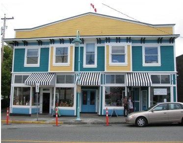
Name: S&W Apartments Location: 403-409 Fitzwilliam Street Date: 1910

The manse, rock wall, landscaped grounds and attached hall all have a historic and physical relationship to the church and are an essential part of the site's value. The church's tall bell tower and substantial mass dominate this corner of Fitzwilliam Street and make the building a highly visible historic landmark.