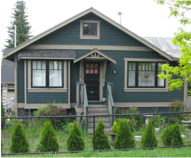
Name: Rogers/Violette Residence Location: 368 Milton Street Date: 1931

Built in 1931, the residence is a very good example of a vernacular, late Craftsman style bungalow. Although updated, the building features many design elements typical of this style including long and low proportions, gable roof, narrow course siding, and gable shingle treatments.