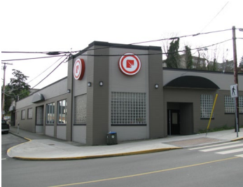
Name: Provincial Liquor Store Location: 25 Cavan Street Date: 1949

The Steel Residence is part of a grouping of heritage buildings in one of the city's oldest neighbourhoods, adjacent to the downtown core.