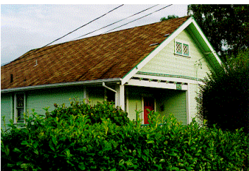
Name: Victoria Road Residence Location: 413 Victoria Road Date: Circa 1892

This Craftsman bungalow was built for Richard Isherwood, a carpenter, who may have been responsible for its construction; he is listed as resident elsewhere the following year. The house features art glass panels in the upper window sash, twin-coursed shingles in the gable ends, and an inset front corner porch with a square column. Set close to the streetline, the setting of this well-maintained house is enhanced by the mature arbutus trees in the front yard.