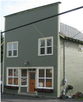
Name: Fourth Street Store Location: 423 Fourth Street Date: Circa 1910

The building is located on a corner lot and is sited prominently on Fourteenth Street. It represents a rare surviving example of the early miner's cottage building form still located on its original site.