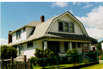
Name: Western Fuel Company House #24 Location: 715 Farquhar Street Date: Pre-1908 (rebuilt 1916)

The building is located amidst mature vegetation on a large lot in a compatible rural use area, and is prominently viewed from both Extension Road and the abutting Chase River School.