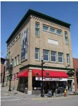
Name: Ashlar Lodge Masonic Temple Location: 101 Commercial Street Date: 1923