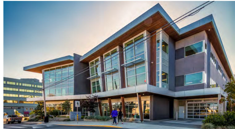
Some ways to pay your taxes: online, at your local financial institution or at the Service and Resource Centre (pictured above) located at 411 Dunsmuir Street.

Learn how your taxes are distributed, ways to pay, view videos and more, by visiting www.nanaimo.ca/goto/taxes