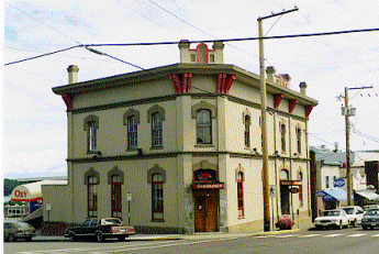
Name: Occidental Hotel Location: 432 Fitzwilliam Street Date: 1886-1887

The Central Dairy building is an integral part of a significant grouping of historic commercial buildings on this street.