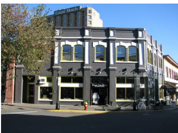
Name: Earl Block Location: 2-4 Church Street Date: Circa 1888-1890