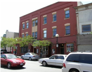
Name: Eagle Hotel (later the Terminal Hotel) Location: 63 Victoria Crescent Date: 1912-1914

The Nanaimo Pioneer Bakery building illustrates the very early importance of Victoria Crescent as a commercial district. The building has been in continuous use as a commercial building for over 125 years, the longest known continuous business use of any building in the downtown area. The Nanaimo Pioneer Bakery building, which follows the curve of the street, is part of a significant grouping of historic buildings in this area.