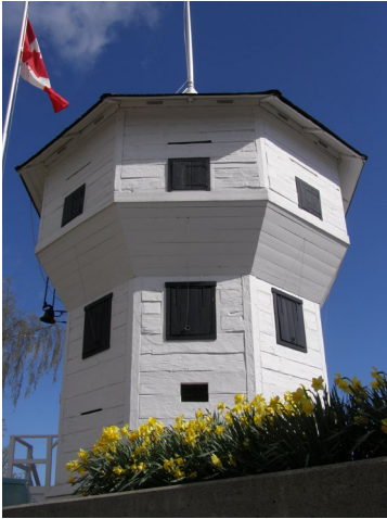
Name: Bastion Location: 94 Front Street Date: 1853 - 1855

Nanaimo's oldest building and the sole reminder of the Hudson's Bay Company's singular coal mining venture, the Bastion is the physical evidence of the community's earliest European social and economic development.