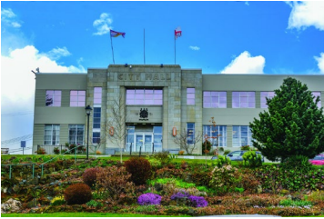
Name: Nanaimo City Hall Location: 455 Wallace Street Date: 1950-1951

From incorporation in 1874 to the completion of this building in 1951, civic business was conducted from a succession of inferior buildings inherited from other organizations. The purpose-built City Hall represents the maturation and modernization of the municipal government and, by extension, the City as a whole.