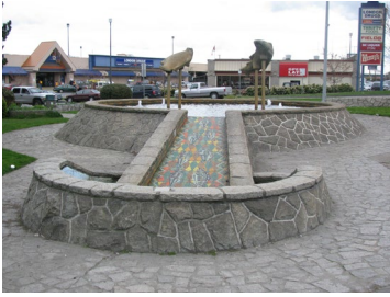
Name: Italian Centennial Fountain Location: 626 Terminal Avenue Date: 1959-1961