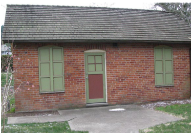
Name: Brick Cottage Location: 1904 Jingle Pot Road Date: Circa 1910-1912