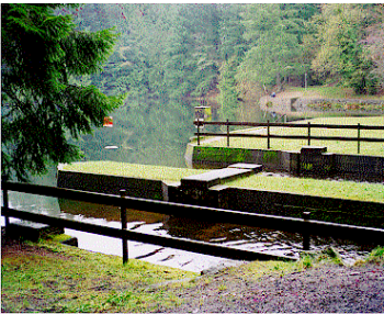
Name: Harewood Colliery Dam Location: 645 Wakesiah Avenue Date: 1910-1911

The Italian Centennial Fountain was dedicated by the Italian Centennial Fountain Committee to the City of Nanaimo on June 24th, 1961. The Italian Centennial Fountain is a landmark structure surrounded by mature landscaping sited on a highly visible property along the Island Highway at the southern entrance point into Nanaimo's downtown core.