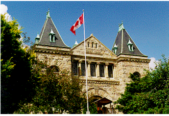
Name: Nanaimo Court House Location: 31-35 Front Street Date: 1895-1896

Grand and imposing in its rugged monumentality, this structure serves as the symbol of justice in Nanaimo. Around the turn of the century, the rapidly expanding population had necessitated a reorganization of the provincial court system, and a number of new regional court houses were constructed.