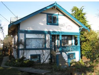
Name: Rosehill Street Residence Location: 508 Rosehill Street Date: Circa 1900-1910