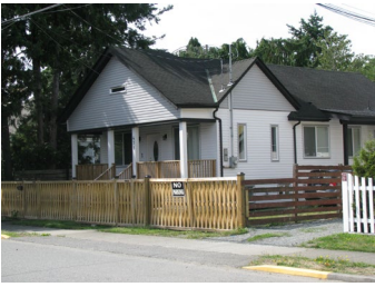
Name: Manson Residence Location: 471 Selby Street Date: 1885-1887