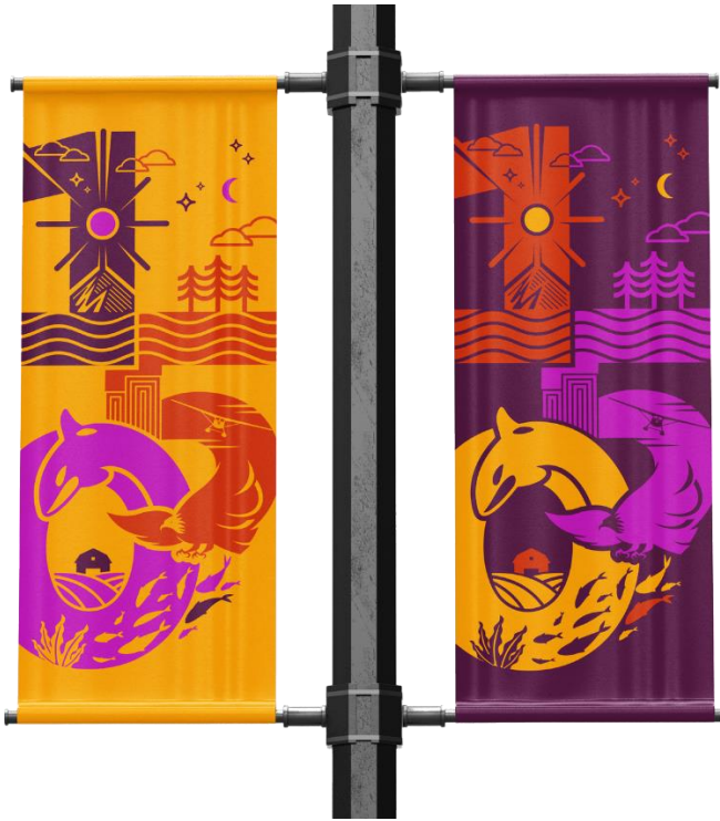
Amy Pye, 2024