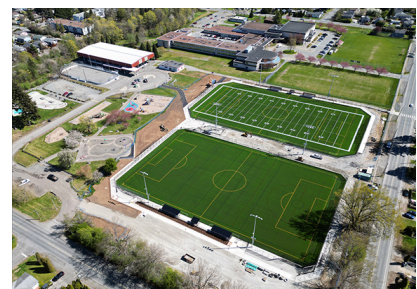
Harewood Centennial Park