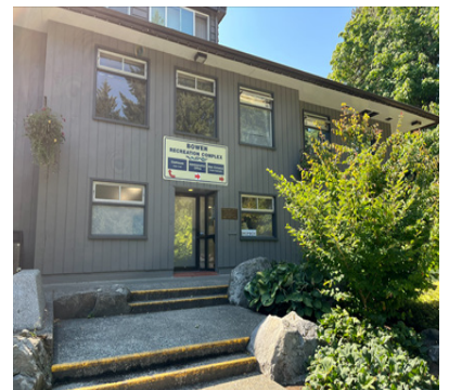
Lower Bowen Complex

Your Name Temporary Public Art Program City of Nanaimo Culture and Events